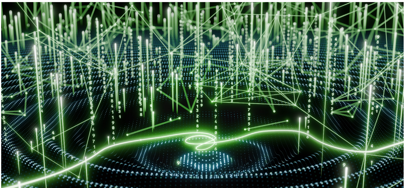
Artist's impression of optoacoustic computing.